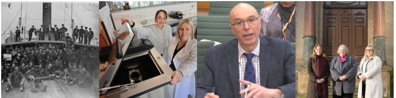
Northumbria contributes to