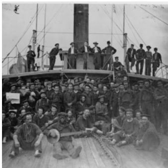
Northumbria Contributes to groundbreaking research Using AI