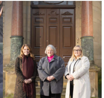
Government backs new centre for writing in the North East