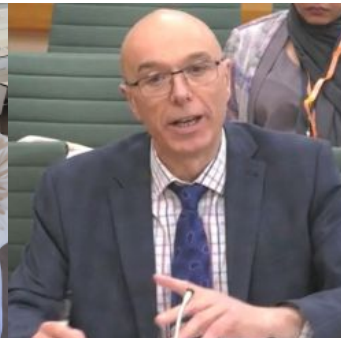
National planning reforms shaped by Northumbria expert